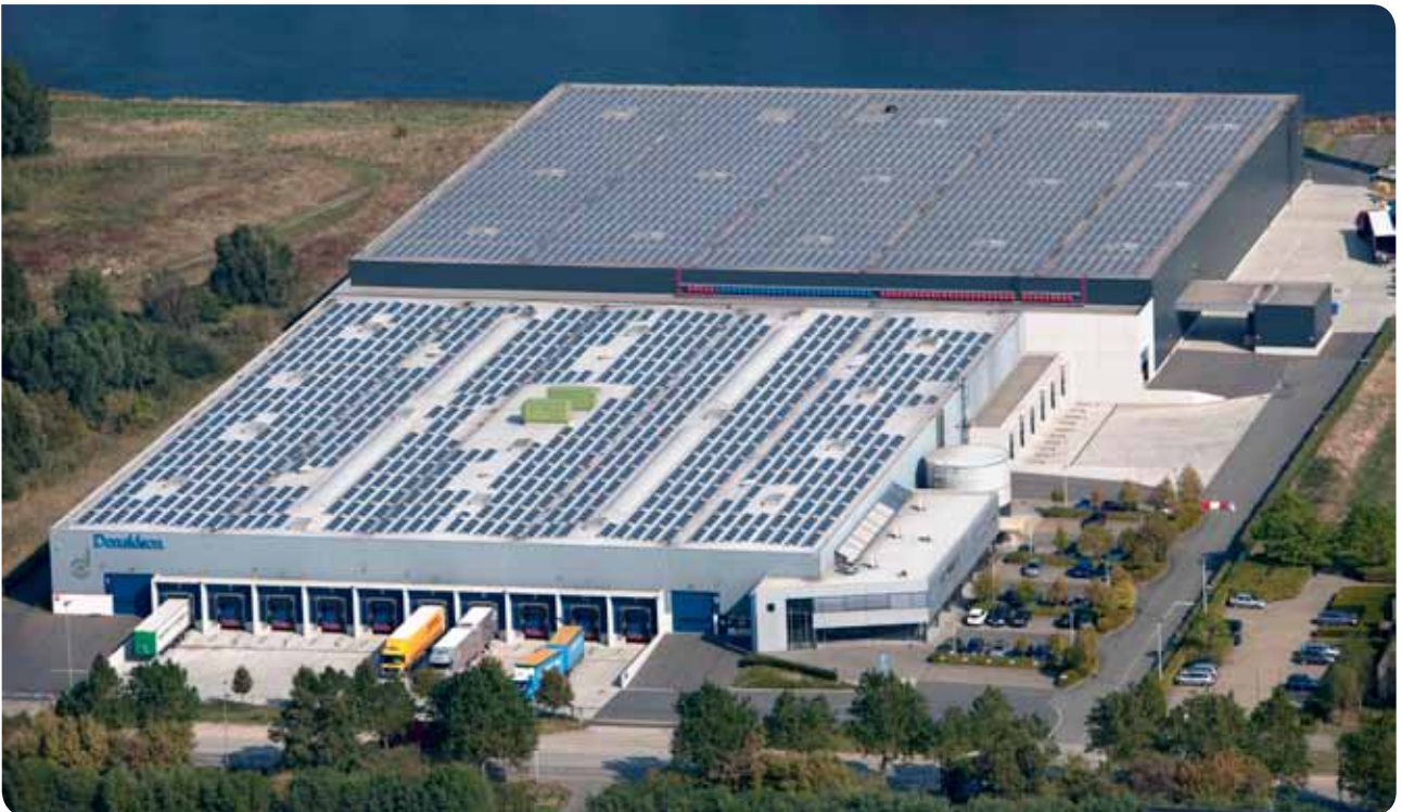
Donaldson Europe - Bruges - Belgium - 970 kWp

There are options for those who would like to benefit from solar arrays on their rooftops, without committing the required resources or taking the risks associated with rooftop solar projects. One such option is leasing your roof to a qualified, experienced developer who will finance, design, install, maintain, and operate the solar array. Likewise, developers can offer joint venture models for cost and revenue sharing, which also work to reduce the capital outlay and risk to the building owner. Such models enable a greater number of building owners to boost the cashflow of real estate assets at no cost or commitment of resources, while participating and making a valuable contribution to the sustainable energy initiatives of the Province of Ontario.