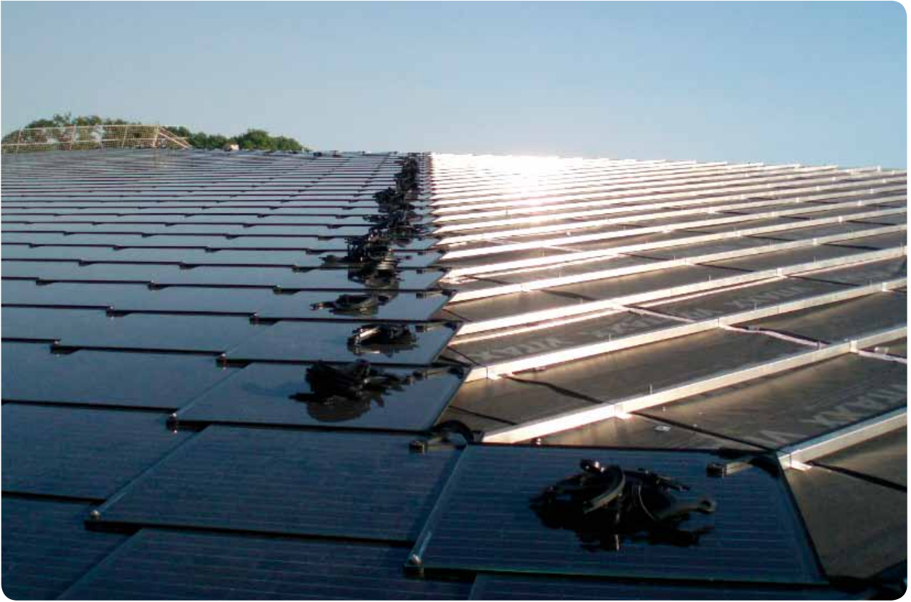
St. Charles - Perpignan - France - 9.1 MWp