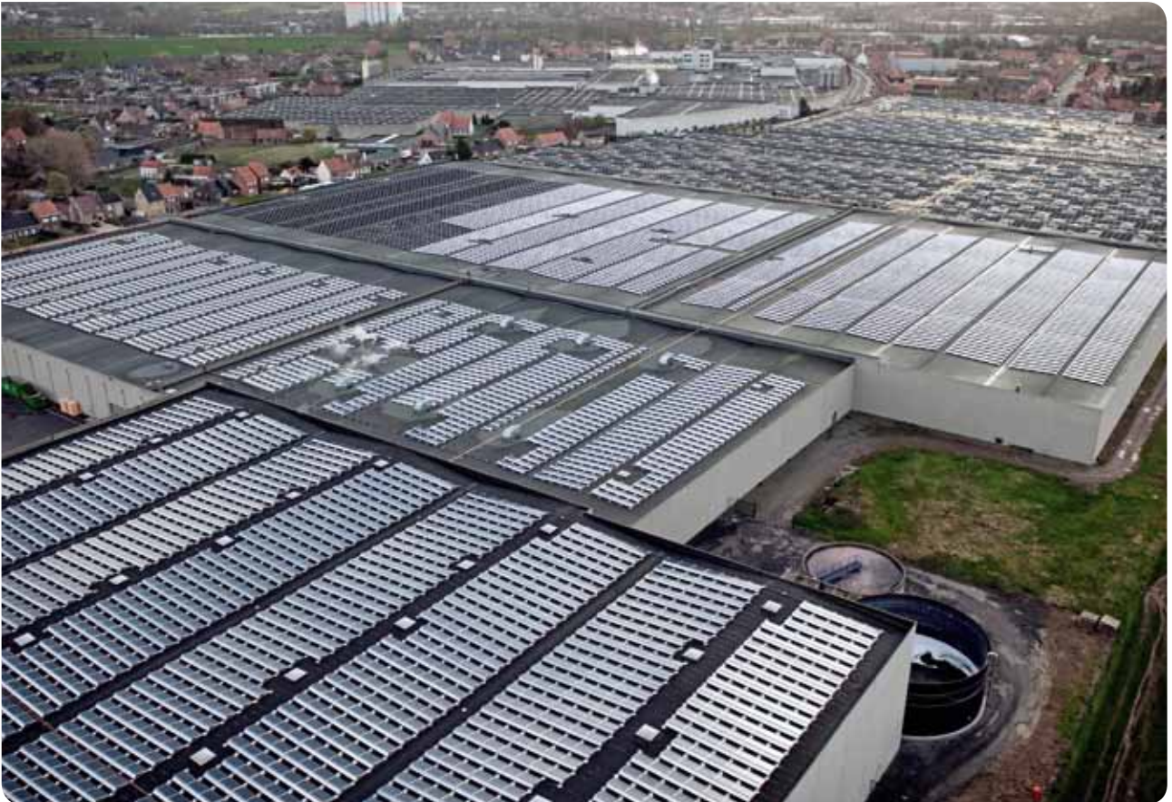
Balta - Sint-Baafs-Vijve - Belgium - 4.385 MWp